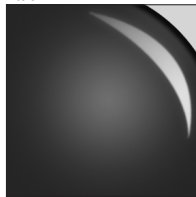
Black - BLK